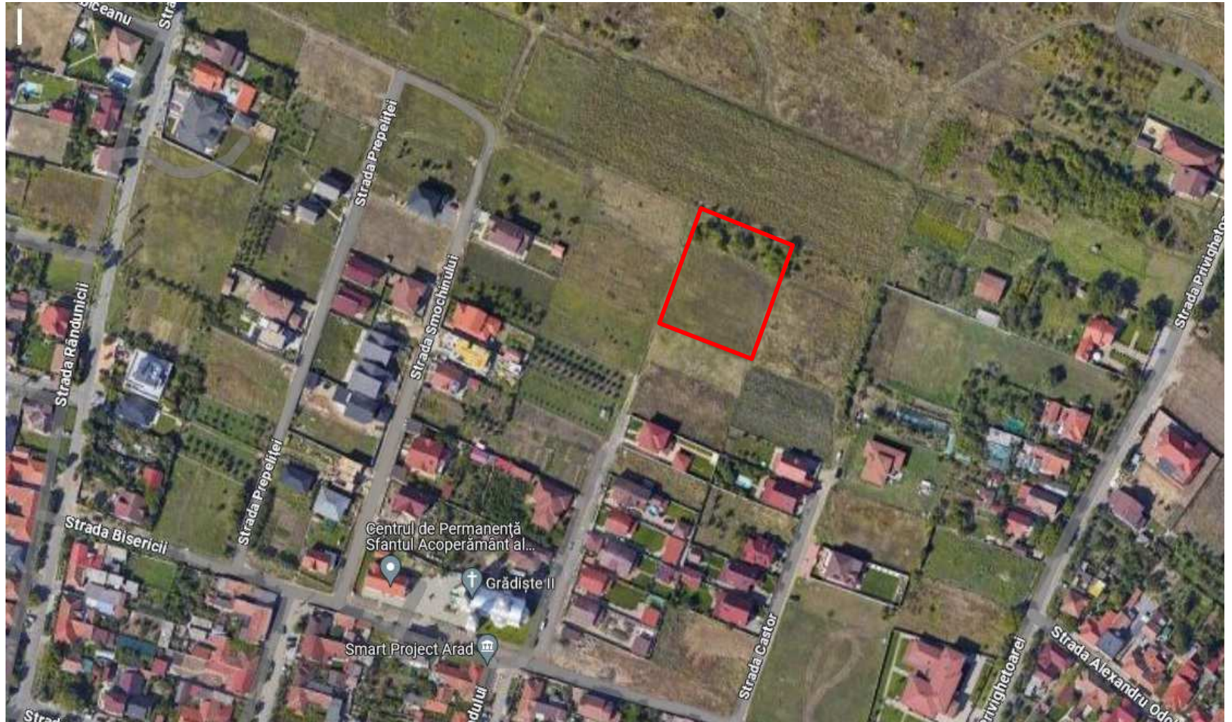
INCADRARE IN ZONA